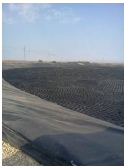
Picture: 3500 m 2 water reservoir. Controlling evaporation and growth of algae

Effective, easy, maintenance free and long lived